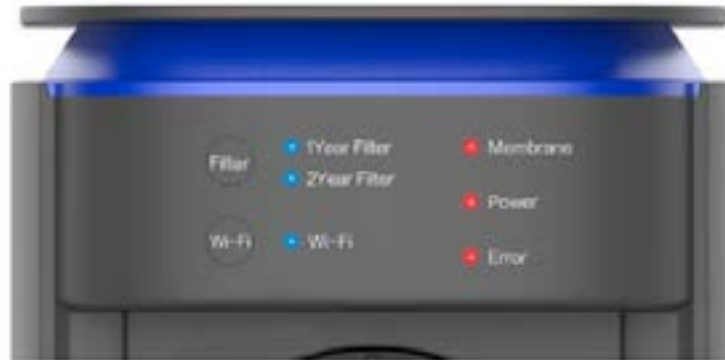
Figure 1. Smart RO unit LED indicators